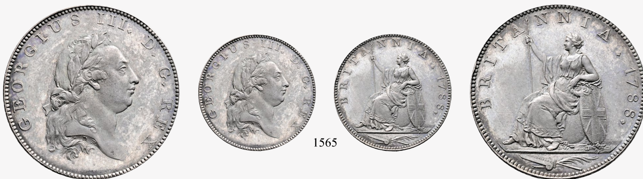
1565 AE Silver Plated Pattern Halfpenny, 1788. By J. P. Droz. Late Soho issue. Laureate head right, GEORGIUS III. D. G. REX, rev. Britannia seated left holding spear, crossed palm branch and rudder in exergue, BRITANNIA. 1788., edge: RENDER TO CESAR THE THINGS WHICH ARE CESARS (raised), 16.40 g., 6h. BMC 964. Blue dusky toning with some brilliance. Good EF. Rare. NGC PF 62 (2184437-048) 1'500

On this pattern Halfpenny Droz revives the Render edge inscription first employed by Simon on the Reddite Crown, see lot 1511 above.