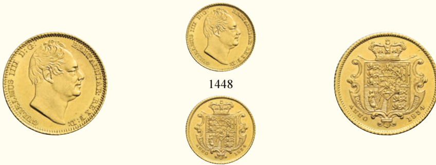
1448 AV Half Sovereign. Dated 1834. Marsh 410; SCBC 3830. In NGC encapsulation 2153870-047, graded MS 61. CHF 1'500