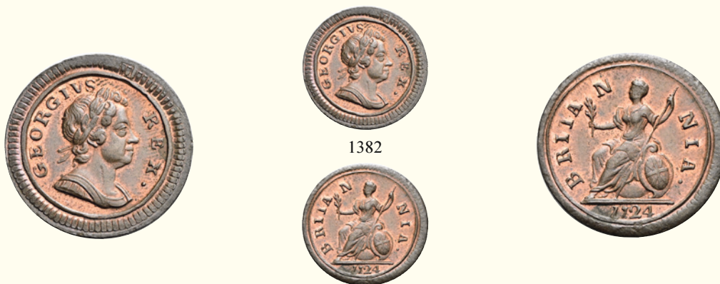
1382 CU Farthing. Dated 1724. Peck 828; SCBC 3662. Highly lustrous. In NGC encapsulation 2153856-009, graded MS 64 RB. CHF 600