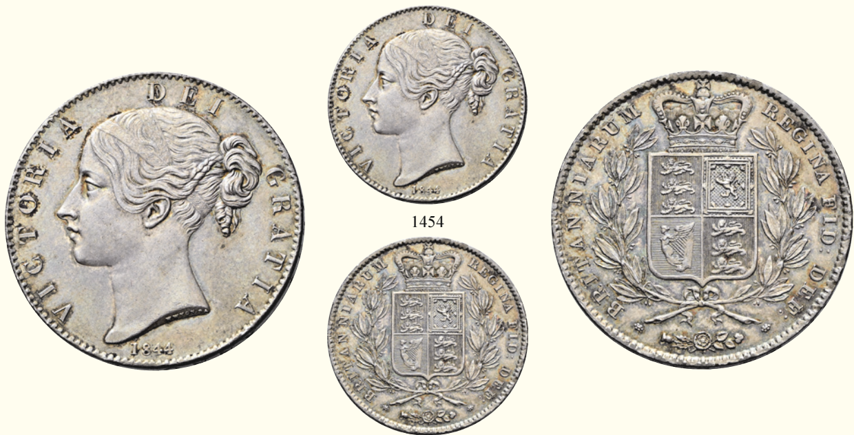
1454 AR Crown. Dated 1844 and RY VIII. Young head. Eight-pointed star stops. Bull 2561; ESC 280; SCBC 3882. An unusually high grade example with wonderful surfaces. Rich blue tone. In NGC encapsulation 2153881-017, graded MS 62. CHF 4'000 Conservatively graded by NGC in our opinion.