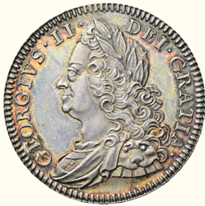
1391 AR Halfcrown. Dated 1746/5 LIMA and RY VICESIMO. Bull 1689; ESC 607; SCBC 3695A. Spectacular pink toning with much blue lustre. In NGC encapsulation 2153810-034, graded MS 64+. CHF 1'500