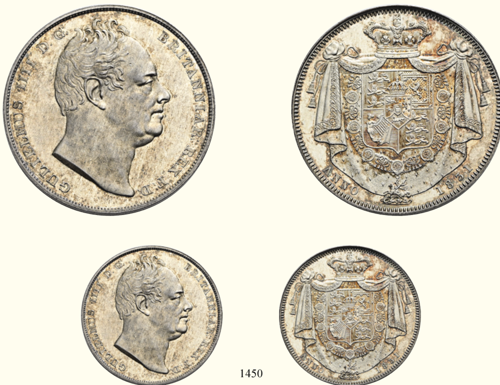
1450 Proof Pattern AR Crown. Dated 1831. W. W. incuse on truncation. Edge: plain. Bull 2462; ESC 271; SCBC 3833. Virtually pristine specimen. The obverse with delicate toning and a cameo effect. The reverse with flashes of amber toning around devices. In NGC encapsulation 2153882-008, graded PF 63. CHF 20'000