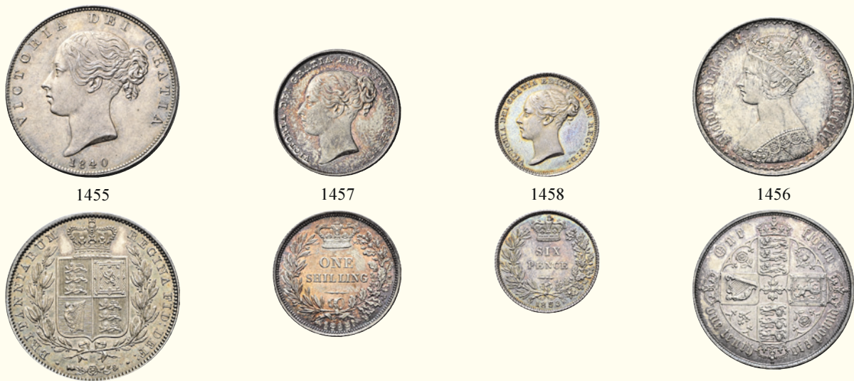
1455 AR Halfcrown. Dated 1840. Young head. Bull 2715; ESC 673; SCBC 3887. In NGC encapsulation 2153881-018, graded MS 64. CHF 1'000 1456 AR Florin. Dated 1852. Gothic type. Bull 2820; ESC 806; ESC 3891. In NGC encapsulation 2153880-001, graded MS 64. CHF 500 1457 AR Shilling. Dated 1858. Young head. Bull 3011; ESC 1306; SCBC 3904. In NGC encapsulation 2153879-043, graded MS 64. CHF 300 1458 Proof AR Sixpence. Dated 1853. Young head. Edge: milled. Bull 3190; ESC 1699; SCBC 3908. In NGC encapsulation 2153879-050, graded PF 65. CHF 800