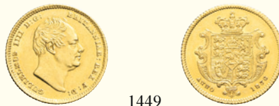
1449 AV Half Sovereign. Dated 1836. Marsh 412; SCBC 3831. In NGC encapsulation 2153863-037, graded MS 61. CHF 800