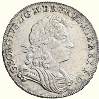
1370 AR Halfcrown. Dated 1720 and RY SEXTO. Roses & plumes in angles. Bull 1556; ESC 591; SCBC 3642. Minor adjustment marks under gun metal toning. Underlying brilliance. Rare. In NGC encapsulation 2153870-040, graded MS 62. CHF 3'000