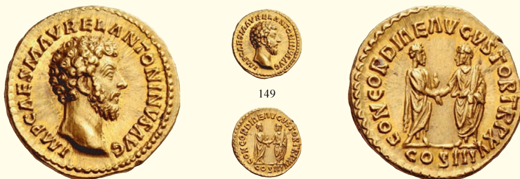
Marcus Aurelius augustus, 161 – 180. Aureus, Roma 161, AV 7.38 g.