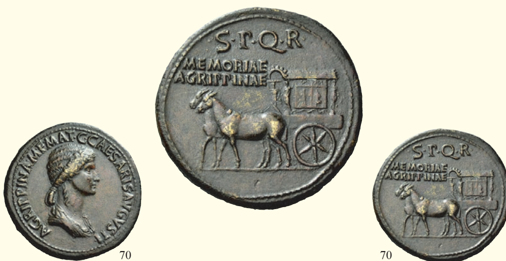
Agrippina Senior, wife of Germanicus and mother of Gaius. Sestertius Roma 37-41, Æ 28.40 g.