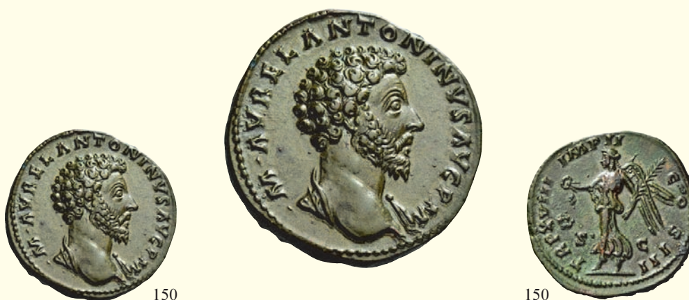
Marcus Aurelius augustus, 161 – 180. Sestertius, Roma 164, Æ 25.16 g.