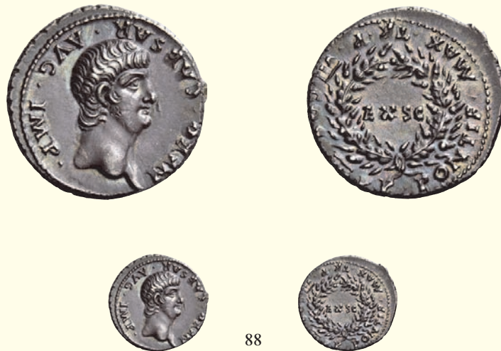
Nero augustus, 54 – 68. Denarius, Roma 60-61, AR 3.80 g.