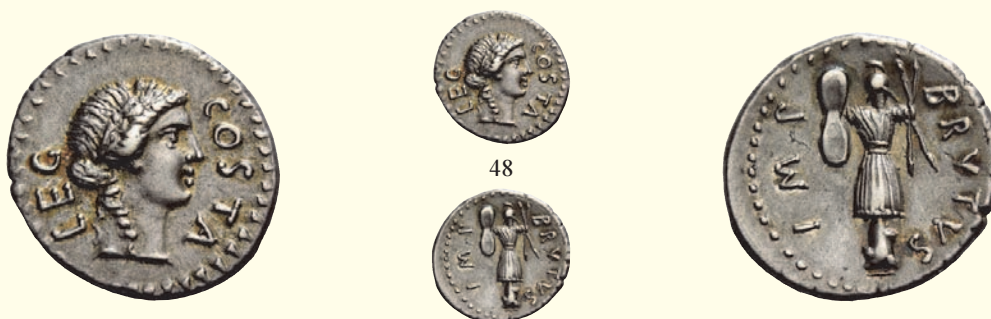
M. Iunius Brutus with Pedanius Costa. Denarius, mint moving with Brutus 43-42, AR 3.72 g.