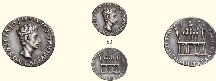
Octavian as Augustus, 27 BC – 14 AD. Denarius, Colonia Patricia (?) circa July 18-17/16 BC, AR 3.70 g.