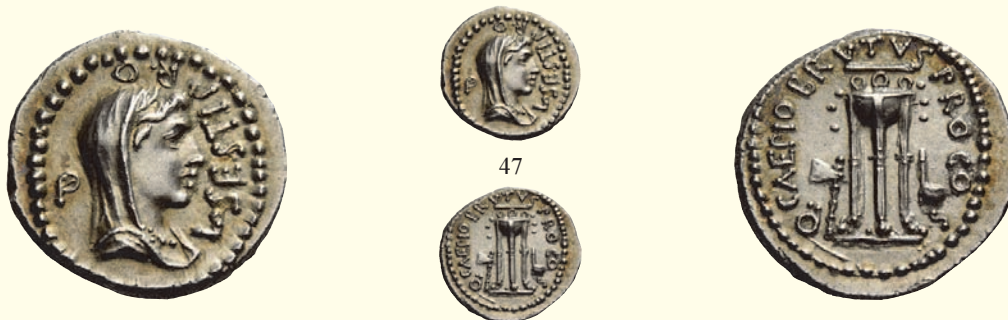
Q. Caepio Brutus and L. Sestius Pro. Q. Denarius, mint moving with Brutus 43-42, AR 3.68 g.