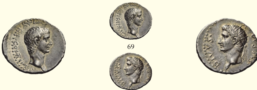
Germanicus, father of Gaius and brother of Claudius. Drachm, Caesarea Cappadociae circa 33-34, AR 3.94 g.