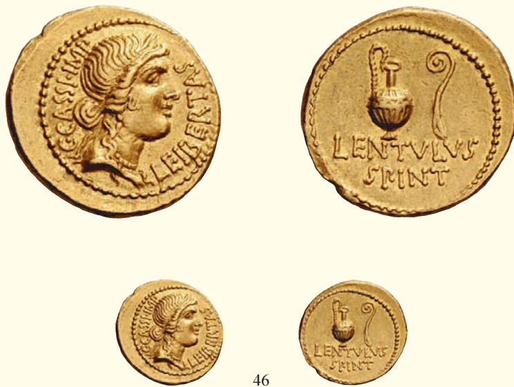
C. Cassius Longinus with Lentulus Spinther. Aureus, mint moving with Cassius (probably Smyrna) 43-42, AV 8.13 g.