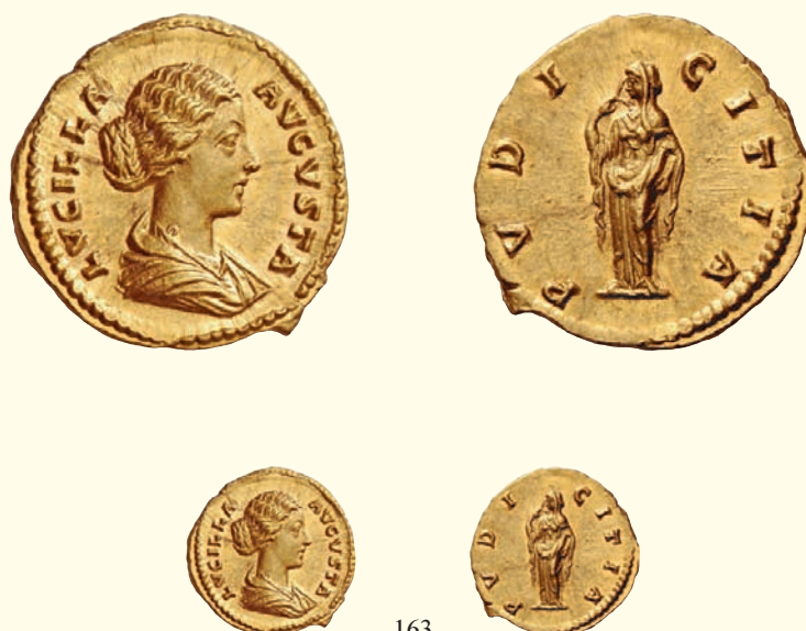
Lucilla, wife of Lucius Verus. Aureus, Roma 164-169 or 183, AV 7.31 g.