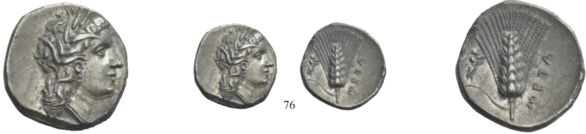
76 Nomos circa 290-280, AR 22 mm, 7.98 g. Wreathed head of Demeter r. Rev. META Barley-ear; in l. field, satyr playing pipes. Johnston D2.8. Historia Numorum Italy 1614. Rare. Struck in high relief and extremely fine 750