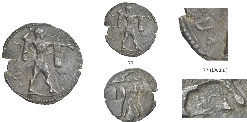
Poseidonia 77 Nomos circa 520-500, AR 28 mm, 6.35 g. ΠΙΟΣ Poseidon bearded, diademed and naked but for chlamys over shoulders, advancing r., hurling trident in upraised r. hand. Rev. The same type incuse. de Luynes 525. Gillet 206. Historia Numorum Italy 1107. Garraffo, Le riconiazione in Magna Grecia e Sicilia , —. An exceptionally rare overstrike of a nomos of Poseidonia over a nomos of Kaulonia. Old cabinet tone. Traces of overstriking clearly visible on obverse and an irregular flan, otherwise about extremely fine 3'000

Ex Naville Numismatics sale 15, 2015, 9.