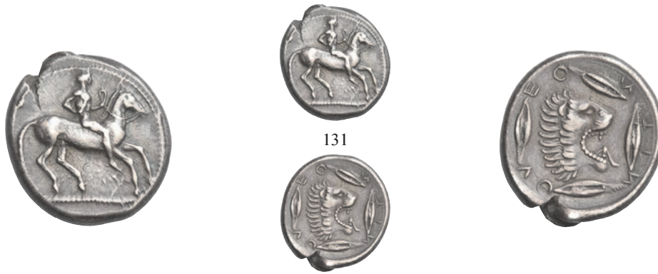
131 Didrachm circa 475-470, AR 19 mm, 9.26 g. Naked horseman advancing r. Rev. Λ – EO – N – TIN – ON Lion's head r. with jaws open and tongue protruding; around, four barley grains. SNG ANS 209 (these dies). Boehringer, Studies Price, 12.

A very rare denomination in unusual condition for this very difficult issue. Wonderful old cabinet tone and good very fine / about extremely fine 1'000