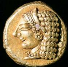
165 3 : 1