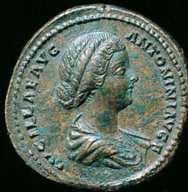
454 1,5 : 1