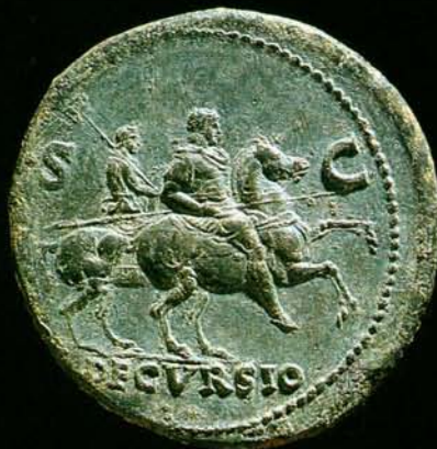
374 1,5 : 1