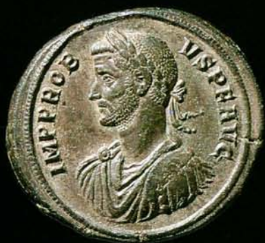
515 1,5 : 1