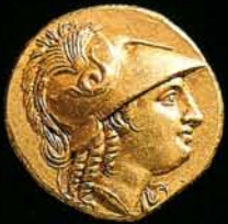
129 1,5 : 1