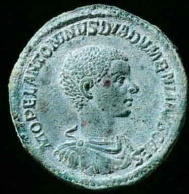
478 1,5 : 1